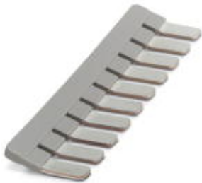
Insertion bridge, pitch: 15 mm, number of positions: 10, color: gray

Please be informed that the data shown in this PDF Document is generated from our Online Catalog. Please find the complete data in the user's documentation. Our General Terms of Use for Downloads are valid ( http://phoenixcontact.com/download )