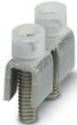
Fixed bridge, Number of positions: 2, Color: silver

Please be informed that the data shown in this PDF Document is generated from our Online Catalog. Please find the complete data in the user's documentation. Our General Terms of Use for Downloads are valid ( http://phoenixcontact.com/download )