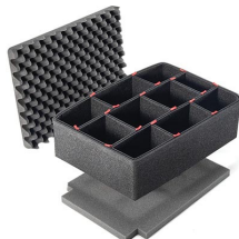
1520TPKIT TrekPak Case Divider Kit