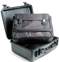
1527 Convertible Travel Bag Only