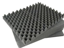
1521 3 pc. Replacement Foam Set