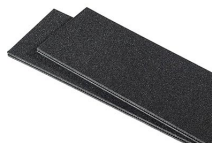
1520TPDIV Extra TrekPak Dividers