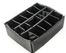
1525 Padded Divider Set