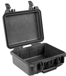
1200NF No Foam