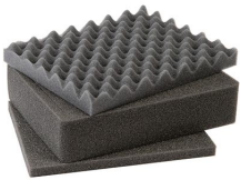
1201 3 pc. Replacement Foam Set