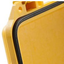
1203 Replacement O-ring