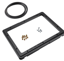
1200PF Special Application Panel Frame