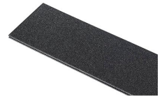
1120TPDIV Extra TrekPak Dividers