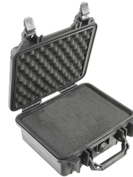
1200WF With Foam