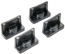
1507 Quick Mounts - set of 4