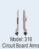
Model: 316 Circuit Board Arms