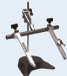
Model: 333 Rapid Assembly Circuit Board Holder