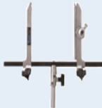
Model: 315 Circuit Board Holder