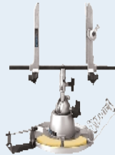
Model: 324 Electronics Work Center