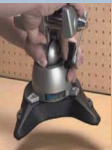
Click on any of the above images to find out more about the products pictured.