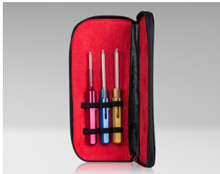
KA-260 - Insertion Tool Kit