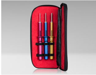
KR-260 - Removal Tool Kit