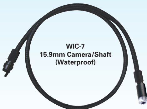
WIC-7 15.9mm Camera/Shaft (Waterproof)