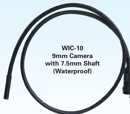
WIC-10 9mm Camera with 7.5mm Shaft (Waterproof)

For other accessories and replacement parts, visit www.WirelessInspectionCamera.com