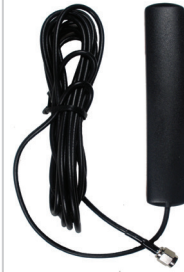
WAN03RSP flat design, adhesive mount