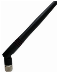
WAN02RSP tilt & swivel design, direct mount connector