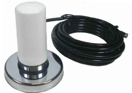
WAN09RSP low-profile mobile antenna, magnetic mount