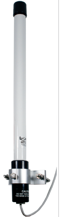
WAN06RNJ straight design, bracket mount