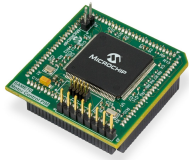
SAME70 Motor Control Plug-In Module (Part # MA320203)