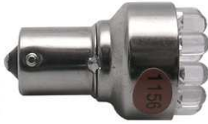
Replaces 1156 bulb