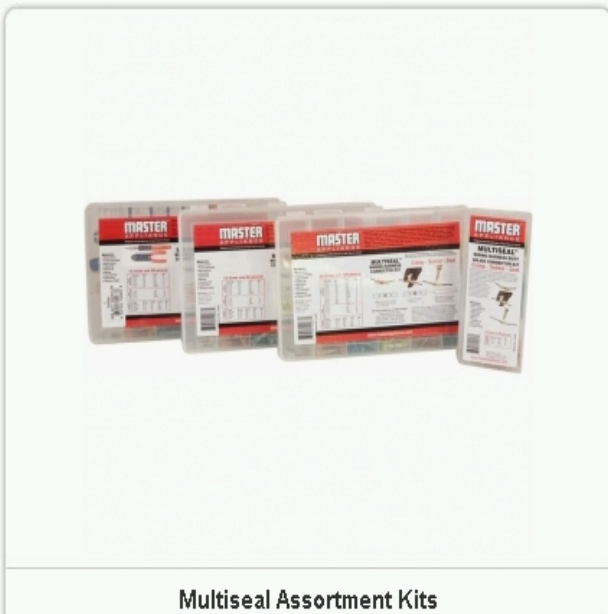
Multiseal Assortment Kits