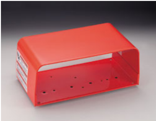
Full Guard Twin - 522-B12