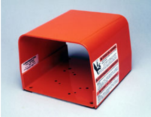
Full Guard Single - 522-B14