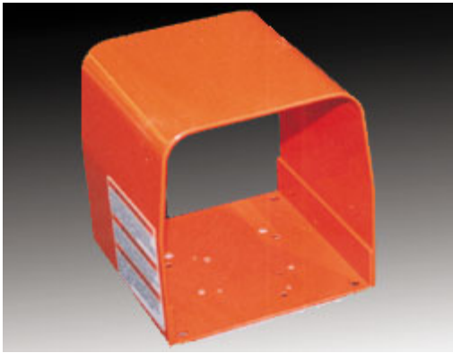
OX Guard Single - 522-F28