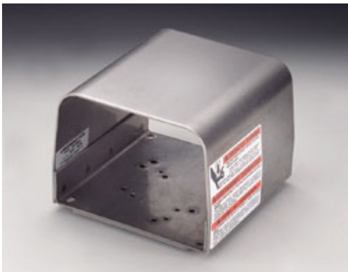
Full Guard Single (Stainless Steel) - 522-K26