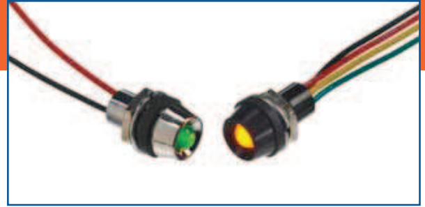
5mm Panel Mount LED Assemblies