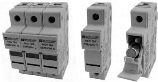
Shown left to right: 6SM30A3I-C, 6SM30A1-C, 6SM30A1-C shown with fuse (fuse not included)