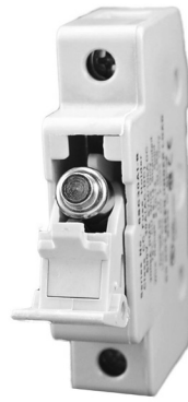
6SC30A1-B shown with fuse (fuse not included)