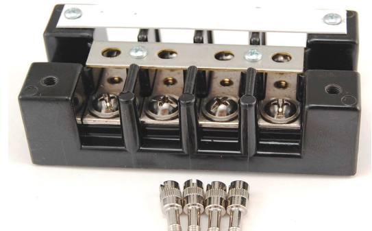
4 pole shown