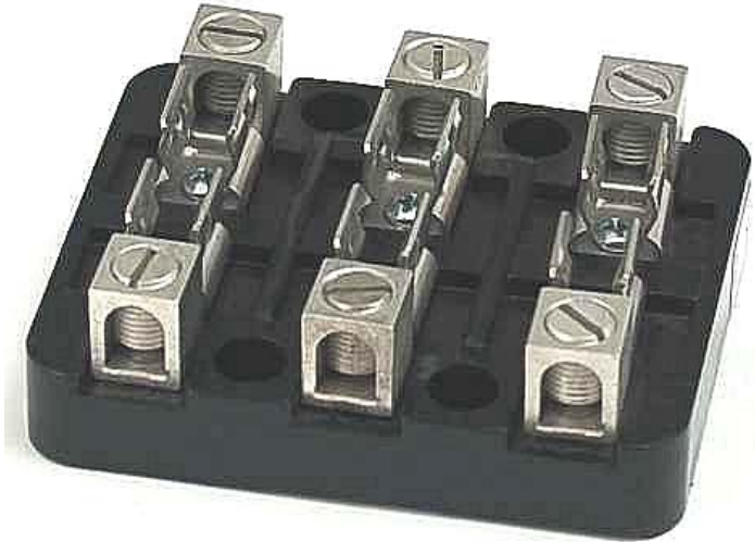
3- pole shown