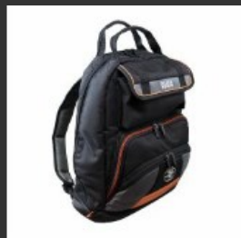
55475 Tradesman Pro™ Tool Bag Backpack, 35 Pockets, Black, 17.5-Inch