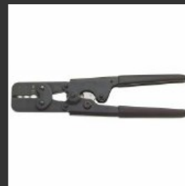
T1715 Full Cycle Ratcheting Crimper - Insulated Terminals