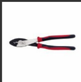
J1005 Journeyman™ Crimping and Cutting Tool