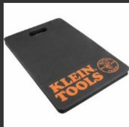
60135 Tradesman Pro™ Standard Kneeling Pad