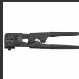
T1710 Compound Action Ratcheting Crimper - Insulated Terminals