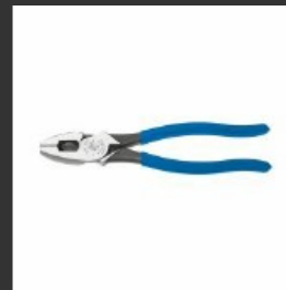
D2000-9NETP Lineman's Pliers, Fish Tape Pulling, 9-Inch