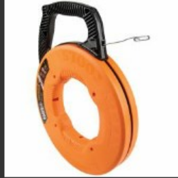
56341 Stainless Steel Fish Tape, 1/8-Inch x 240-Foot