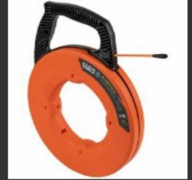
56382 Multi-Groove Fiberglass Fish Tape with Nylon Tip, 50-Foot