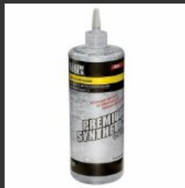
51028 Premium Synthetic Clear Lubricant 1- Quart