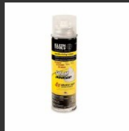
51100 Wire Pulling Foam Lubricant