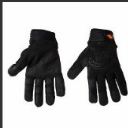
40234 Journeyman Wire Pulling Gloves, XL