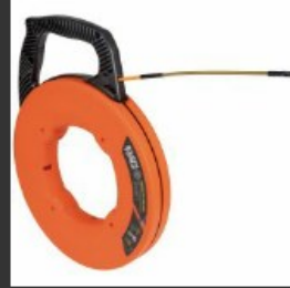
56350 Fiberglass Fish Tape with Spiral Steel Leader, 50- Foot