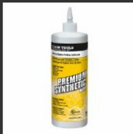
51010 Premium Synthetic Wax Cable Pulling Lube 1-Quart