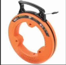
56335 Wide Steel Fish Tape, 1/4-Inch x 25-Foot