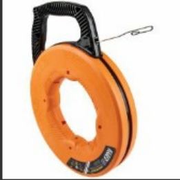
56340 Stainless Steel Fish Tape, 1/8-Inch x 125-Foot