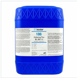
186 Soldering Flux