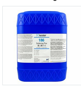
186 Soldering Flux