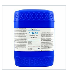
186-18 Soldering Flux