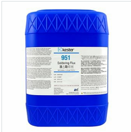
951 Soldering Flux