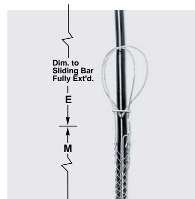
Universal Eye Split Mesh, Rod Closing