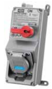
HBLMITL - For use with Watertight Safety-Shroud receptacles, see page B-39.

Notes: For technical information on Twist-Lock® and Watertight Safety-Shroud Devices see pages B-69 and B-70.