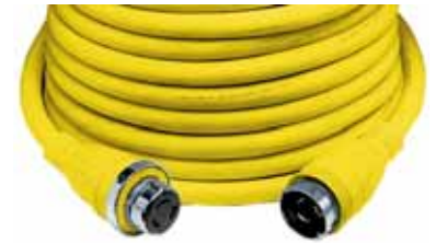
HBL61CM53 HBL61CM53W HBL61CM43

Notes: + Boots are not UL listed. • Features and benefits on page W-14.