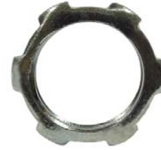
Non-UL Locknuts Steel