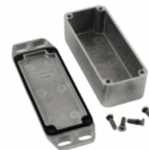
Water-tight versions and gasket upgrades available for most sizes.