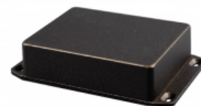
Wall-mounting flange integrated into lid.