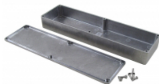
Lap joint construction where lid and box meet.