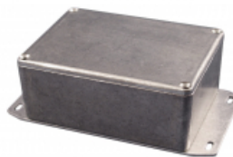
Spot-welded bottom flange