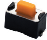
Gull Wing, 320g, Orange Actuator