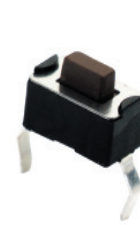
Thru-Hole, 160g, Brown Actuator

Used in applications such as consumer electronics, audio equipment, PCs, VCRs, cable boxes, modems, communications equipment, controls, security and alarm equipment, and test and measurement equipment.