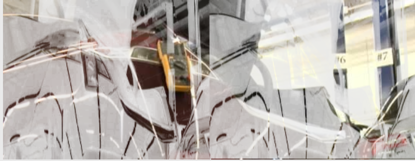
Fluke 233: Remote Display Multimeter for Automotive »