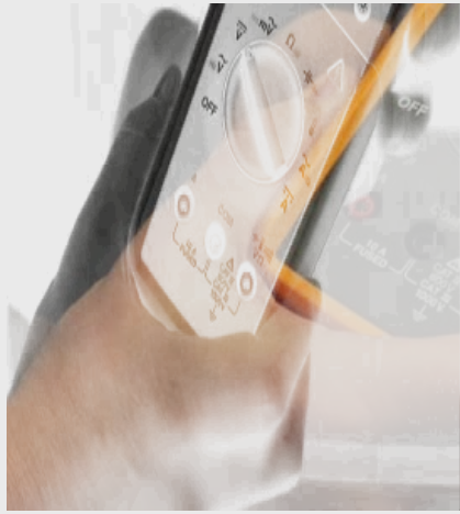
Fluke 233: Video Product Tour »