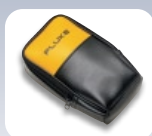
Fluke C25 Large Soft Case ($29.80 value)