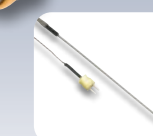
Fluke 80PK-9 General Purpose Temperature Probe ($41.92 value)

Purchase a Fluke 568 Infrared and Contact Thermometer and choose one of these great accessories: