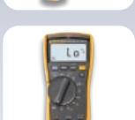
Fluke 117 Multimeter with Non-Contact voltage ($186.95 value)