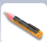
Fluke 1AC-II Volt Detector ($25.25 value)