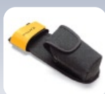
Fluke H3 Clamp Meter Holster ($25.05 value)