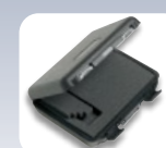
Fluke C101 Hard Case ($45.80 value)