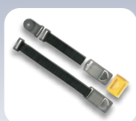
Fluke ToolPak, Meter Hanging Kit ($31.87 value)

Purchase a Fluke 87 V True-rms Industrial Digital Multimeter and choose one of these great accessories: