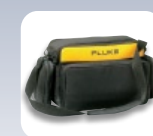
Fluke C195 Case ($141.00 value)