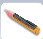
Fluke 1AC-II Volt Detector ($25.25 value)