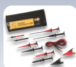
Fluke TLK-225 SureGrip™ Master Accessory Set ($112.51 value)