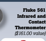
Fluke 561 Infrared and Contact Thermometer ($161.00 value)

Purchase a Fluke 435 Three-Phase Power Quality Analyzer and choose one of these great complimentary products: