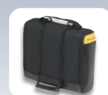
Fluke C789 Case ($97.72 value)