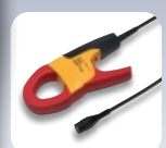
Fluke i400s AC Current Clamp ($210.53 value)

Purchase a Fluke 199C Color ScopeMeter® Test Tool and choose one of these great accessories: