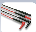
Fluke TL224 SureGrip™ Insulated Test Leads ($21.97 value)

Purchase a Fluke 337A True-rms Clamp Meter and choose one of these great accessories: