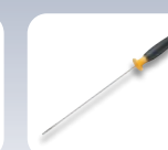
Fluke 80PK-24 SureGrip™ Air Temperature Probe ($87.67 value)