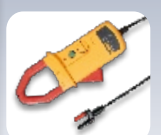
Fluke i410 AC/DC Current Clamp ($187.15 value)

Purchase a Fluke 744 Documenting Process Calibrator and choose one of these great accessories: