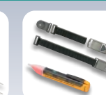
Fluke ToolPak Kit and 1AC-II Volt Detector ($57.12 value)