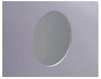
One hole to cut.