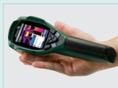
Pocket sized and extremely lightweight—only 12 ounces