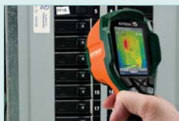
Detect hidden problems fast