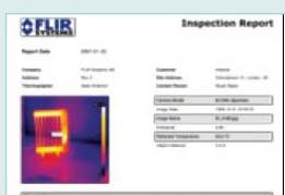
QuickReport™ PC software enables user to analyze Temperature of all JPEG images from microSD card