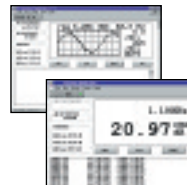
PC Capture of Graphic Display and Data Acquisition. Software Included.