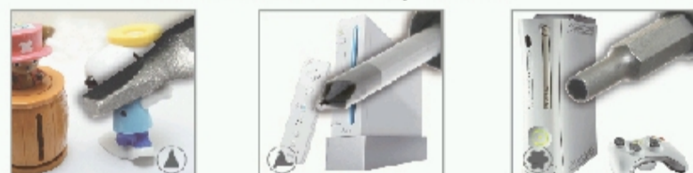
Essential for Wii, SNES, Nintendo handhelds and video games

The TS3.5/TS4.5 Torx Plus® sockets are for Nintendo, SEGA products.