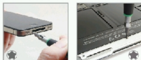
Pentalobe tips:P2 for iPhones,P5 for Macbook, P6 for Macbook Pro

The P2 , P5 , P6 pentalobe tips are special for Apple products.