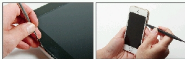
Reinforced nylon spudger is designed for prying, poking, scraping, routing, flipping, detaching, attaching and opening devices.