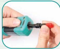
Storage for a spare blade