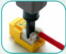
Punch and cut cable terminals