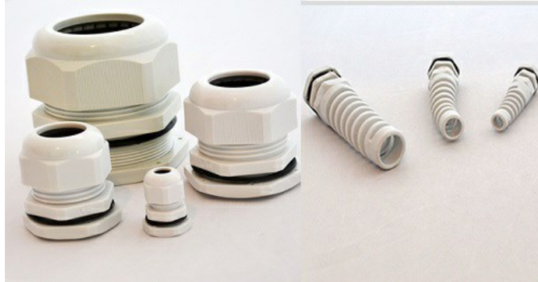
Click on Image for Larger View

Bud's IP66 Nylon Cable Glands are a great combination of tested quality and great price for all your NEMA applications. The IPG series covers a full range from PG7 to PG63 with standard thread length and select extra-long thread for thick enclosure wall. The series also feature a bend proof version for use with bend sensitive cables.