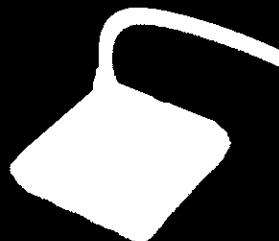
3 Conductor Dual Duplex Receptacle

15A DCR Kits are the only DCR's approved for use in Canada