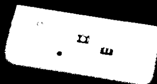
Circuit Adapter, top