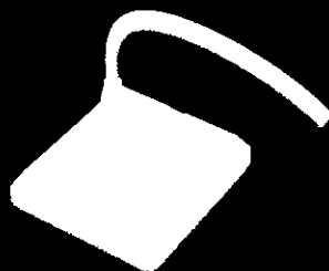
3 Conductor with Voice/Data Blank