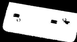
Circuit Adapter, bottom