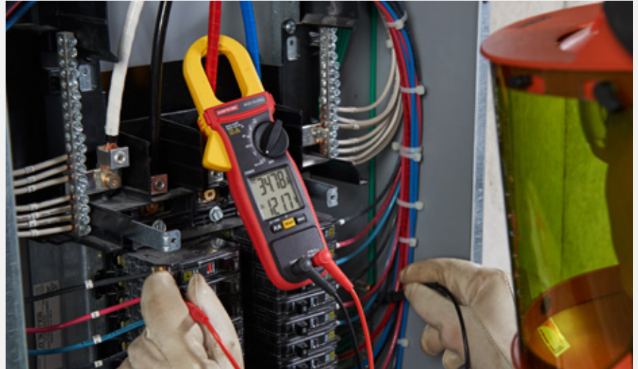
The Amprobe ACD-14-PRO can test and display voltage and current measurements simultaneously with the large backlit LCD dual display, for voltage drop tests and other applications.

Voltage drop test - dual display allows user to view voltage and current simultaneously to assess voltage drop for current changing from zero to a maximum value.