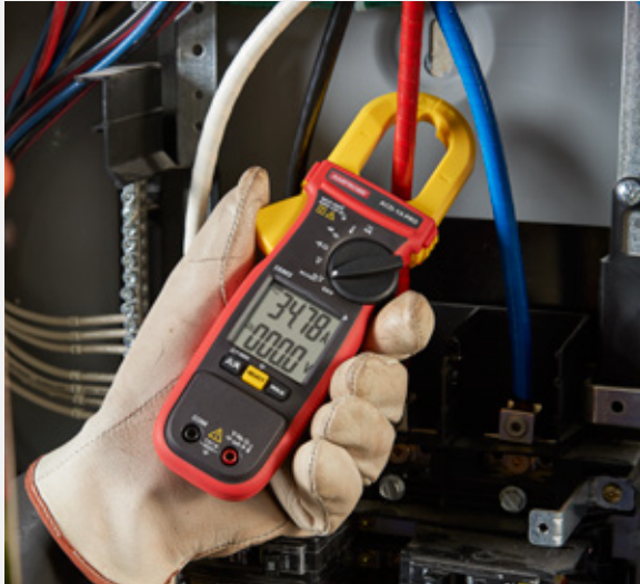
The Amprobe ACD-14-PRO features low profile jaws to test in tight spaces with TRMS for accurate measurements.