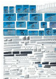
1165 Pc. Ultimate Master Set