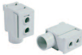
Type/Cat. No: P50UB Description: Modular Direct Power Feed