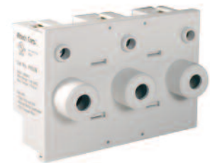
Type/Cat. No: P95UB Description: Power Feed Block