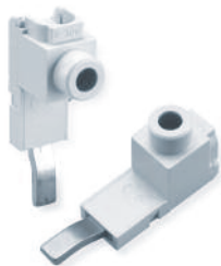
Type/Cat. No: P50UT Description: Power Feed Lug