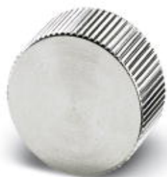
Metal protection cap for power connectors with M23 external thread

Please be informed that the data shown in this PDF Document is generated from our Online Catalog. Please find the complete data in the user's documentation. Our General Terms of Use for Downloads are valid ( http://phoenixcontact.com/download )