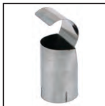
A-160-HG Shrink attachment for tubing up to 3/4"

Professional quality attachments & accessories provide the versatility to do more with your heat tool.