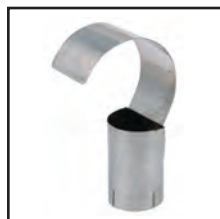
A-170-HG Shrink attachment for tubing 3/4" to 2" O.D.