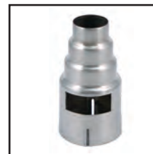
51544 7/8" Reducer attachment