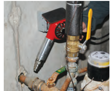
Heat pipes and more