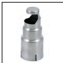
30202 Solder preform attachment