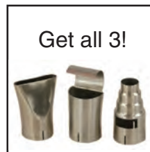
Get all 3! 35245 Three of our most popular attachments