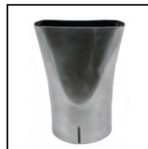
51543 2-1/4" Spreader attachment