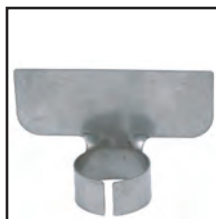
51542 Glass protector attachment