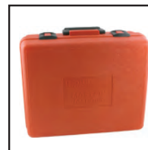
51013 Molded storage and carrying case