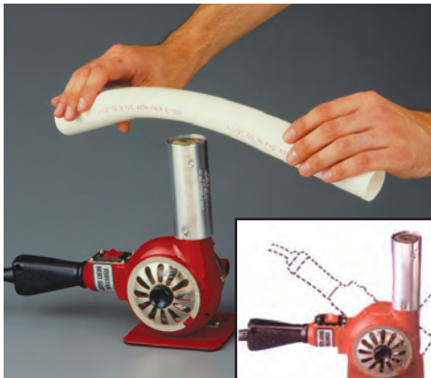
Stable base for hands free use.