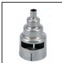
51309 3/8" Pinpoint attachment