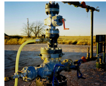
Down Hole Analyzer