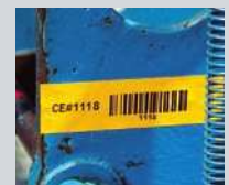
Indoor and outdoor vinyl labels