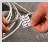
Voice and data communications