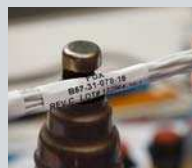
PermaSleeve® wire markers