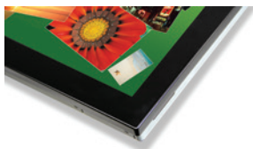
C2167PW Flat Front Surface