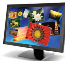
Multi-Touch Desktop Displays

3M™ takes interactive display technology to the next level by combining uncompromising multi-touch performance, brilliant high-definition graphics, wide viewing angles and elegant product design into a fully-integrated, easy-to-use, plug-and-play multi-touch desktop device.