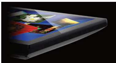
Flat Front Surface (Virtual Bezel)