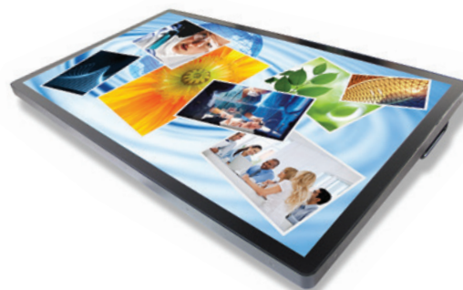
Multi-Touch Chassis Displays

3M combines its industry-leading multi-touch technology that delivers an ultra-fast, accurate, and precise multi-touch response, with a high-definition, wide viewing angle LCD, to create a multi-touch chassis for your next generation interactive application. The rugged all steel frame and a highly durable glass front surface provide the durability needed for demanding public use environment.