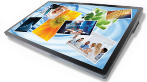
3M Multi-Touch Display C2167PW