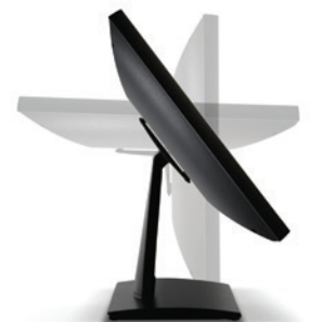
90-degrees of Adjustment