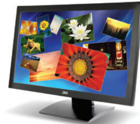
3M Multi-Touch Display M2767PW