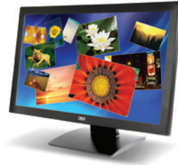
3M Multi-Touch Display M2167PW 3M Multi-Touch Display M2467PW