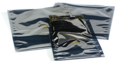
3M™ Static Shielding Bag 1900 and 1910

These bags are tested to meet or exceed certain electrical and physical requirements of Static Shielding Bags, ANSI/ESD S541, and to be ANSI/ESD S20.20 program compliant. Bags are RoHS Compliant* and lead-free**.